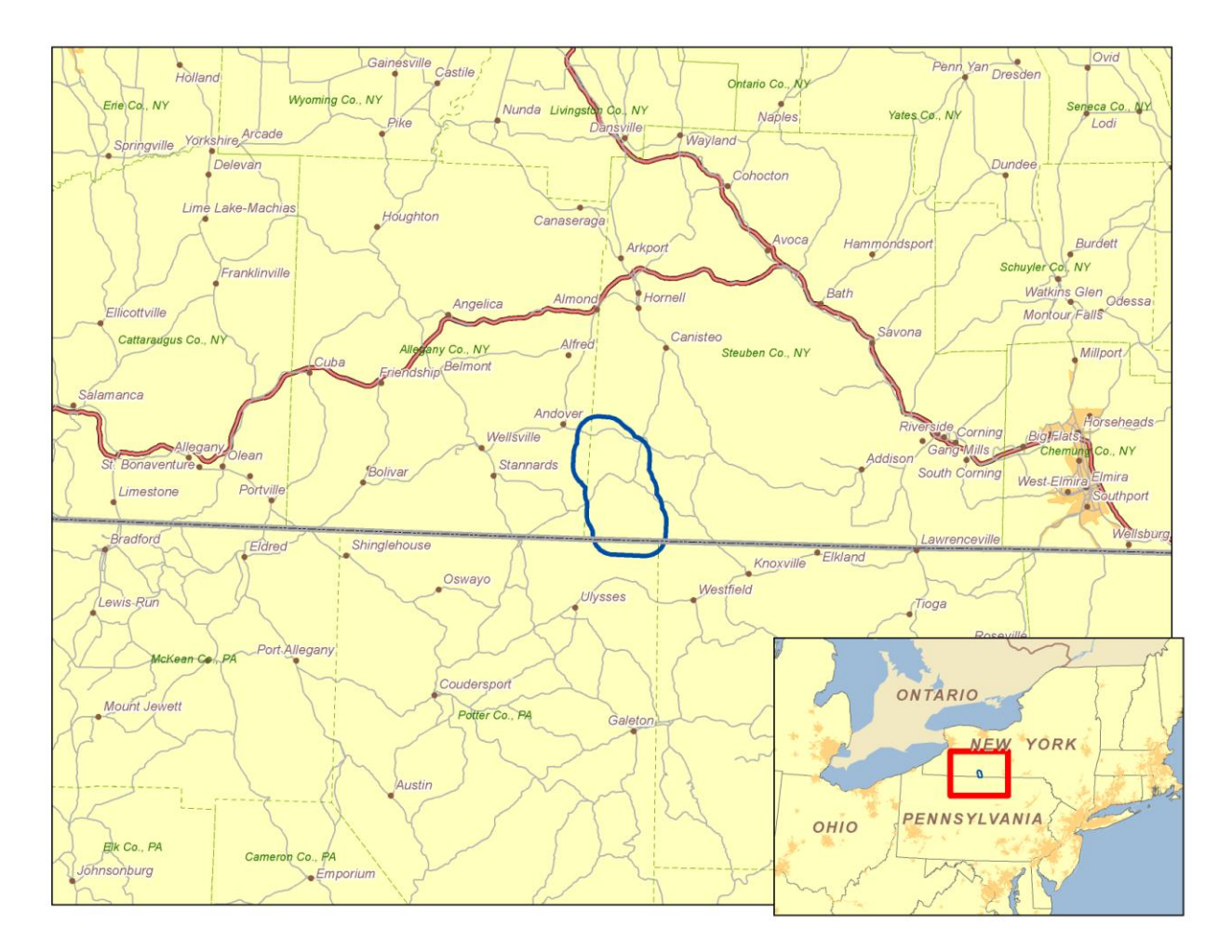
Figure 1: Counties that intersect the Area of Interest

Our mobile phone analysis was performed using Comsearch's proprietary carrier database, which is derived from a variety of sources including the Federal Communications Commission (FCC). Since mobile phone market boundaries differ from service to service, we disaggregated the carriers' licensed areas down to the county level. Then we compiled a list of all mobile phone carriers in the main counties that intersect the area of interest. The area of interest was defined by the client and encompasses the planned turbine locations. A depiction of the wind project area and counties appears below.